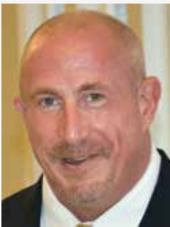
BY Gene Balas CFA® Investment Strategist

Congress' newly passed $1.2 trillion infrastructure bill will improve the nation's productive capacity—dedicating $500 billion to highways, $39 billion to urban transit, $65 billion to broadband projects and $73 billion to electrical grids. These are all projects that may generate dividends well into the future. But this infrastructure investment program (as currently designed) may not generate as much immediate economic activity as one might assume.