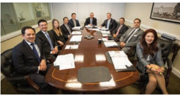
SEIA's Investment Committee (IC)

The textbooks say that fiscal policy tools are best utilized early in the business cycle, as the boost to stimulus can serve to offset early cycle weakness. But when used later in the business cycle, the boost may accomplish little more than the addition of inflationary pressures as there is little slack in the economy to absorb new stimulus. Now eight years after the recession, given the current economic environment (with unemployment already below the Fed's long-term target) and the current agenda (focused on tax reform, deregulation and infrastructure spending), many pundits are calling for ever-rising inflation in the years ahead.